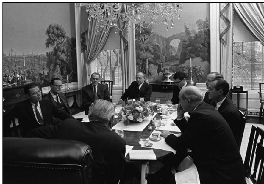
President Johnson convening his national security team in 1967, including Director of Central Intelligence Richard Helms, for a "Tuesday lunch," where a broad range of foreign policy issues were discussed on a weekly basis.

President Lyndon Johnson's White House began receiving analytic updates on Cuba's involvement in the