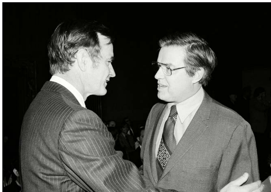
DCI-designate Bush on December 15, 1975 engaging in a cordial exchange with Sen. Frank Church (D-Idaho) just before the Senate Armed Services Committee began to consider Bush's nomination. At the time, Church was also chairman of a Senate select committee, the “Church Committee,” to investigate alleged abuses of the US Intelligence Community during the Vietnam War and before. Church had said publicly he would oppose Bush's confirmation. (See interview of Gary Hart, a member of the Church Committee on page 29.)

He did not comment on his political future until last. Bush declared he was not actively seeking to be Ford's running-mate, and promised not to do so as DCI, but he objected to making his confirmation conditional on the surrender of his possible candidacy. “To my knowledge,” Bush told the committee, “no one in the history of this Republic has ever been asked to renounce his political birthright as the price of confirmation for any office.” He concluded, “In this new job I serve