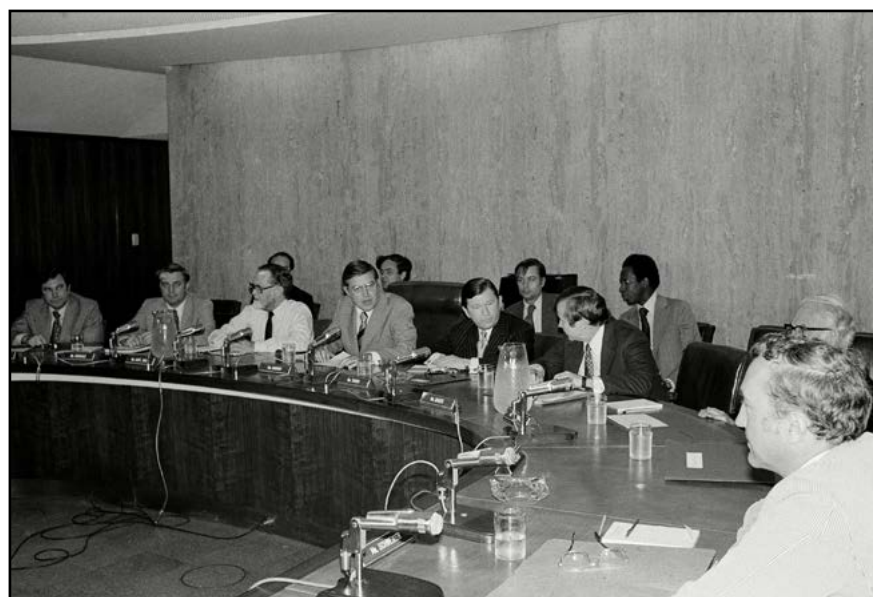
Members of the Church Committee confer just before hearing testimony from then-Director of Central Intelligence, William Colby on May 15, 1975. Conversing from left to right are Chairman Frank Church, Cochairman John G. Tower, and Howard Baker. Senator Gary Hart was not in camera's view.

I can't remember the sequence. Most of 1975 was spent behind closed doors and hearing testimony from Director [William] Colby of the CIA fairly early that spring about what came to be called the Family Jewels, which revealed assassination attempts and foreign government overthrows. b