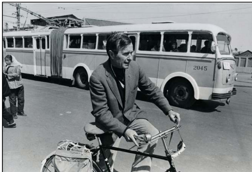
Chief of the US Liaison Office in China Bush about to mount his bike in Beijing, China. On one such weekend ride in November 1975, he was handed an "Eyes Only" cable.

News of Ford's shakeup literally caught up with Bush while he was bicycling home from church in Beijing, a favorite weekly activity. The US Liaison Office's car pulled up with an "Eyes Only" dispatch. 14 Bush had become the top US envoy to China by way of service in the House of Representatives, as UN ambassador, and the Republican National Committee (RNC), where he became the chair not long before Watergate broke. 15 Bush had twice been considered for vice president, most seriously in August 1974 as Ford's replacement, but Rockefeller got the nod instead, in part because