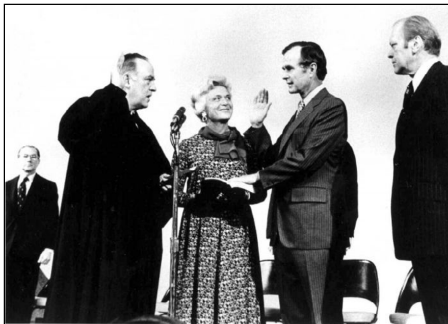
Bush sworn in by Justice Potter Stewart on January 10, 1976. Outgoing DCI Colby (left) attended the ceremony and, with few friends remaining to bid him farewell, immediately drove off alone into retirement.

Bush quickly grew to love the job, despite his initial reservations. The education, competence, and professionalism of CIA personnel frequently amazed Bush, and he became a devoted public advocate. “I realize that dirty-tricks artist James Bond is far more fascinating than a scholarly analyst of foreign political or economic trends, but in seven months as Director of Central Intelligence, I have never met anyone remotely like James Bond,” he said in one such speech. “[D]uring any lunchtime visit to our headquarters cafeteria, I may