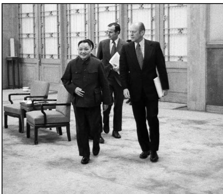
Bush’s arrival to CIA was delayed because he was needed to participate in President Ford’s state visit to Beijing in December 2, 1975. Above Ford and Bush are escorted from a meeting by Vice Premier Deng Xiaoping.

Bush also tried to work the Hill. On November 7, 1975, he cabled the White House with talking points to help both deal with queries and raise support (he also noted his distaste for